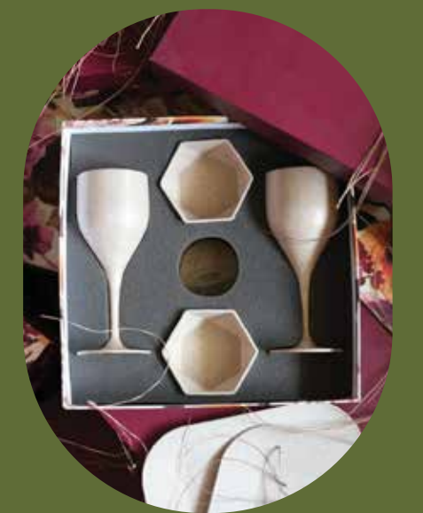
Sustainable customized tableware hampers