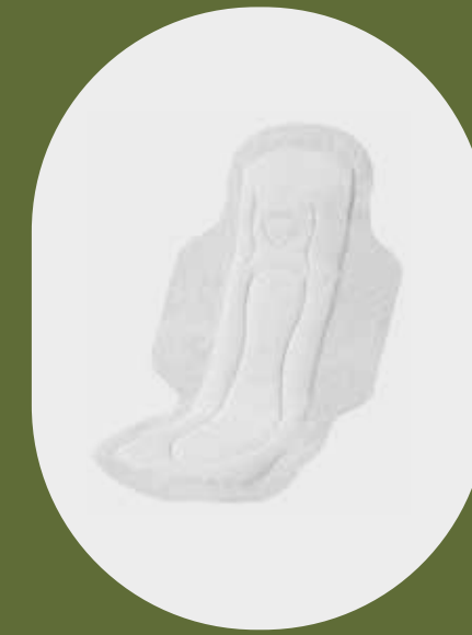
Eco-friendly sanitary pads and liners