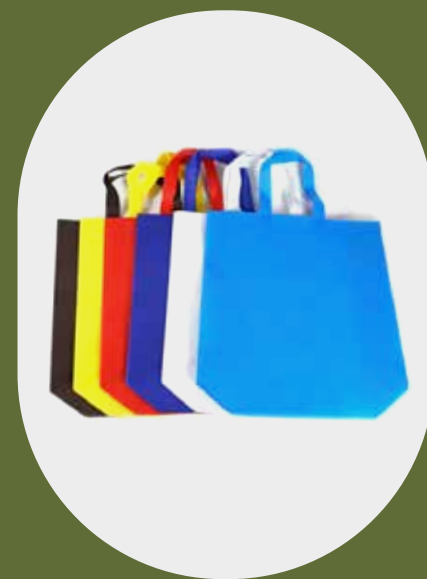
PP Woven and non-woven bags