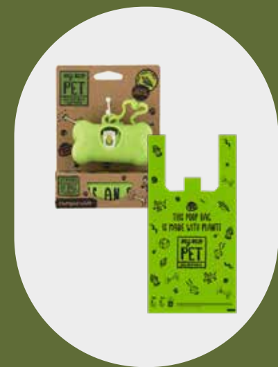
Pet waste bags