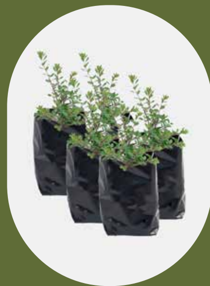
100% compostable plantation bags