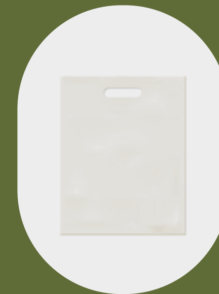
D-cut carry bag