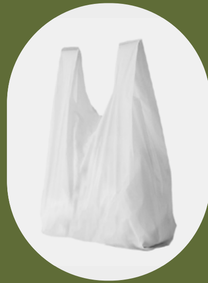
Grocery bag & t-shirt bag