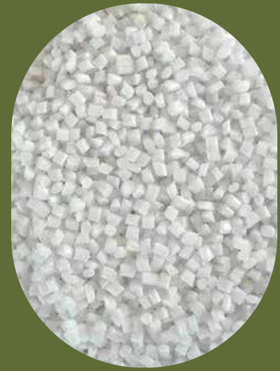
Compostable and Biohybrid resin

Our product portfolio ranges from 100% compostable to all sustainable materials reusable bags. These are some of the products we offer.