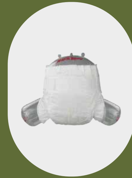
Eco-friendly baby diapers and pants