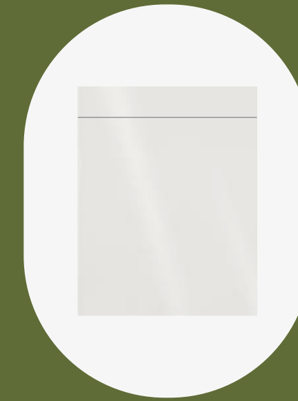
Water soluble bag